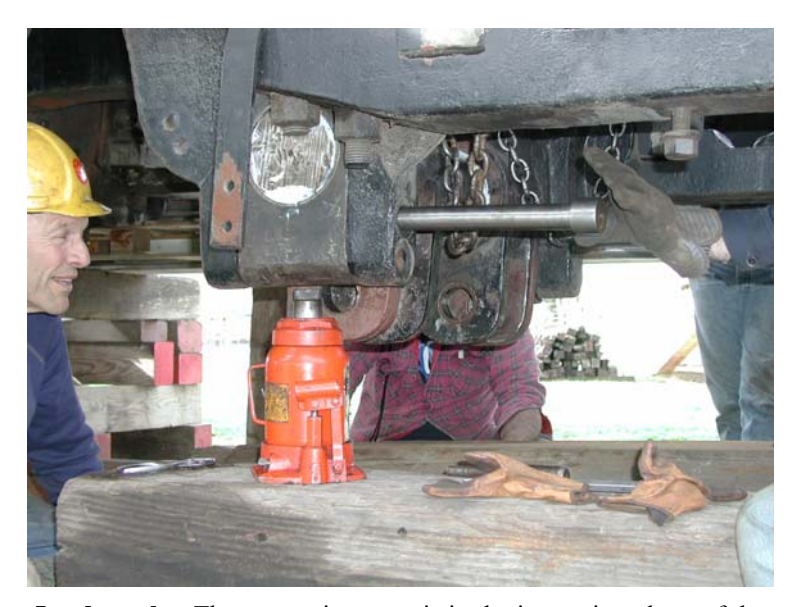
Lead truck – The restoration crew is in the inspection phase of the

motive brake rigging. These levers weigh in at couple hundred pounds each. They have been re-bored and new hard bushings were installed.