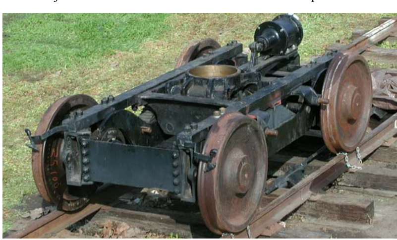
Leading truck reassembled on 17 JAN 2004 Awaiting brake rigging

A height problem was discovered once the lead truck was reassembled. This will require the machining of wear plates on the journal boxes. All but two holes have been completed