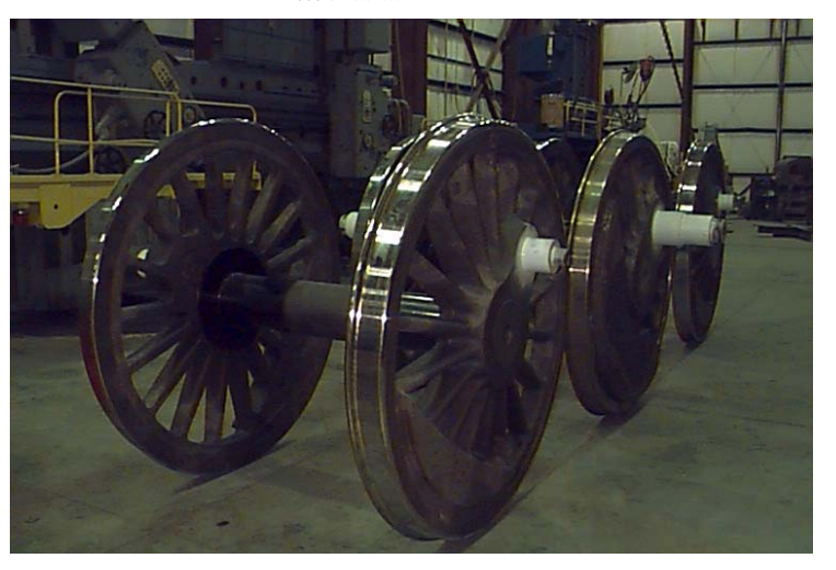
Reconditioned driver wheels

been removed. Preparations for new stay bolts are being investigated. Rod calls Manley every other week but there hasn't been a resolution of the contract issue. Jack estimated that it would cost $5,000 to replace the stay bolts. Rod asked and was assured that budget remained in that project to complete the boiler work.