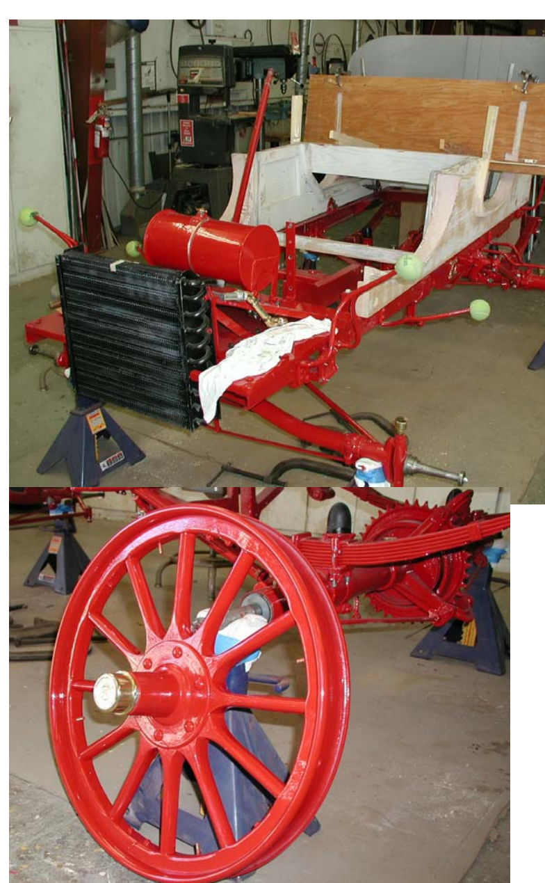
For those who cannot see this in color it is a very bright red.

We now have lots of parts painted a deep red. This includes the frame, wheels, front and rear axles, springs and the various parts connecting them together. So the lower part of the car will be red and the upper part white. We're getting excellent advice and support from local experts and shops.