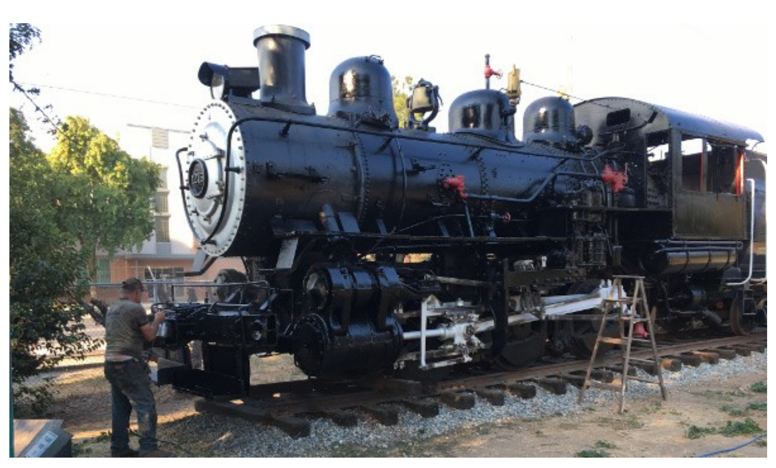
The 1215 being spruced up.

It is also the time of year when the site needs a fair amount of work. Trees need trimming, we need a lot of weed whacking, and the roof of the trailer needs to be cleaned. As well, the equipment needs to be protected as well as we can, which means putting tarps over the drivers ans the brake cylinders to ward off the rain water. We also have some places on the container roofs that need patching. Once the rains start, we will need to mow the site regularly.