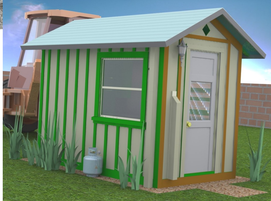
A lonesome yardman.