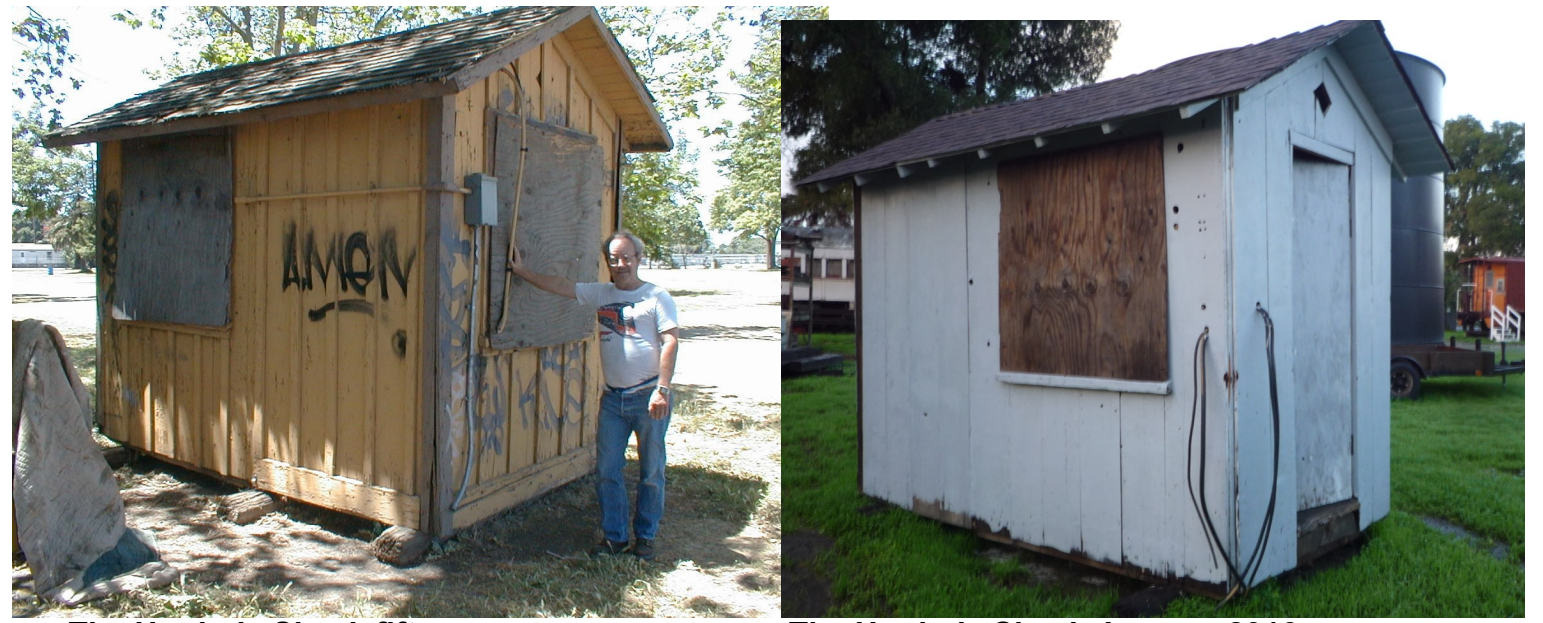
The Herder's Shack fifteen years ago.