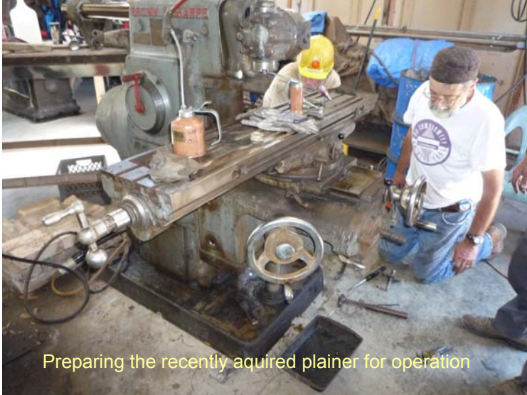
Preparing the recently acquired plainer for operation