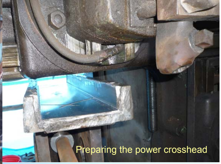
Preparing the power crosshead