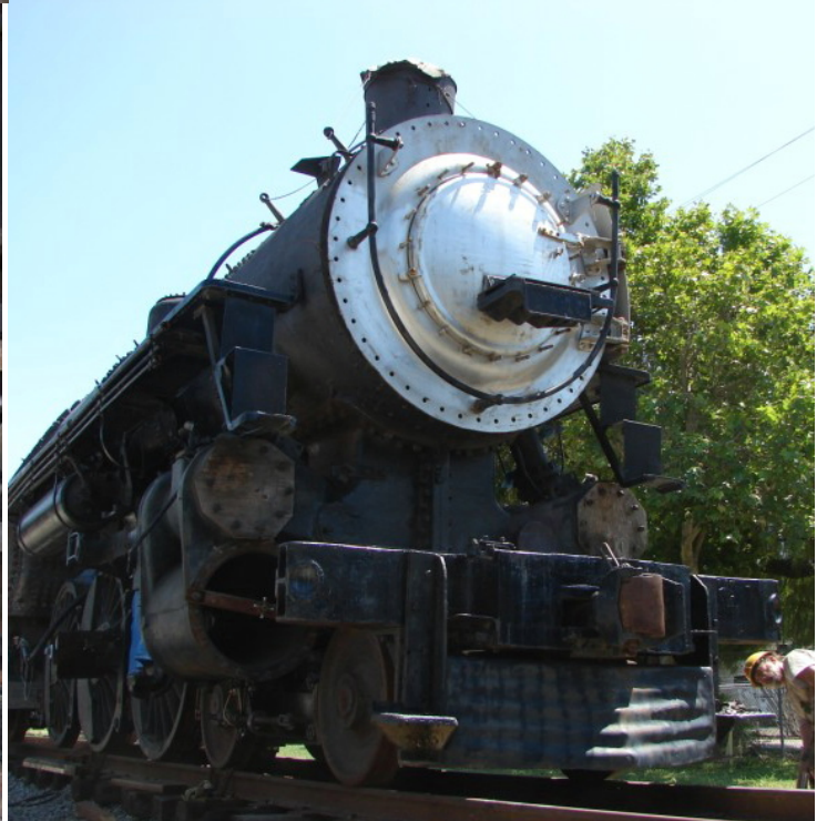
The 2479 with pilot attached.

← Tom Anderson using a unique boring bar setup to bore the upper crosshead guide mounting structure.