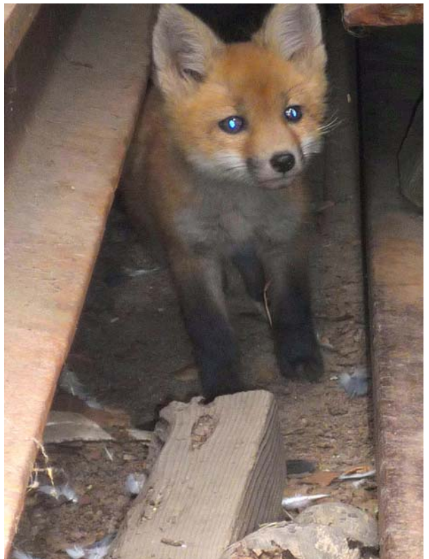
Besides kittens we had a bunch of kit foxes adding to the zoo at the locomotive.