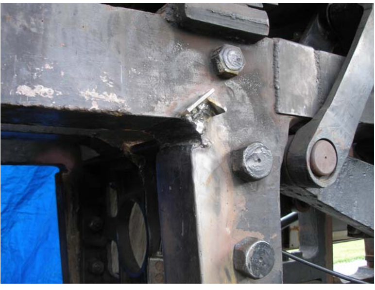
Replaced #2 left pedestal face.

Welded large cracks where pedestal joins the main frame beam.