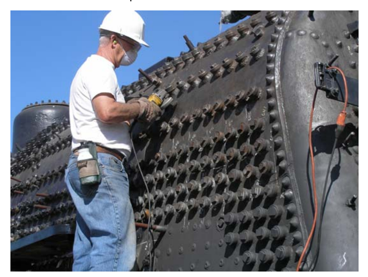
Install and hammer seal all remaining firebox stays.