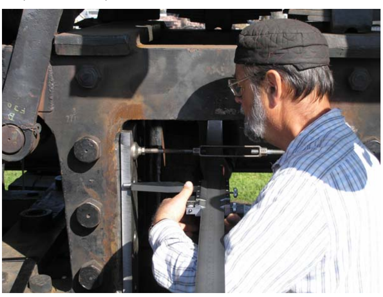
Ground flat #2 left and right shoe and wedge pedestal shoulders after weld repair.