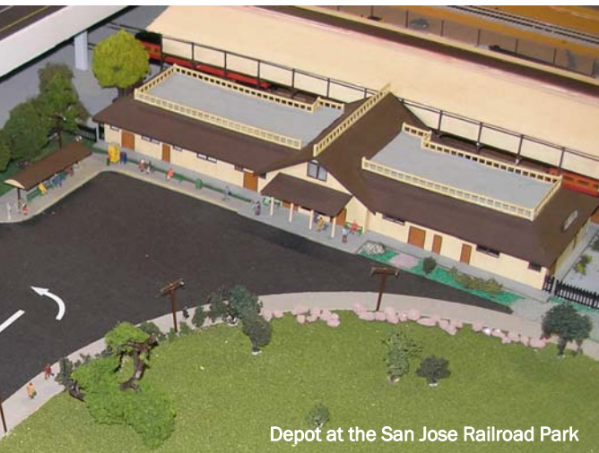
Depot at the San Jose Railroad Park