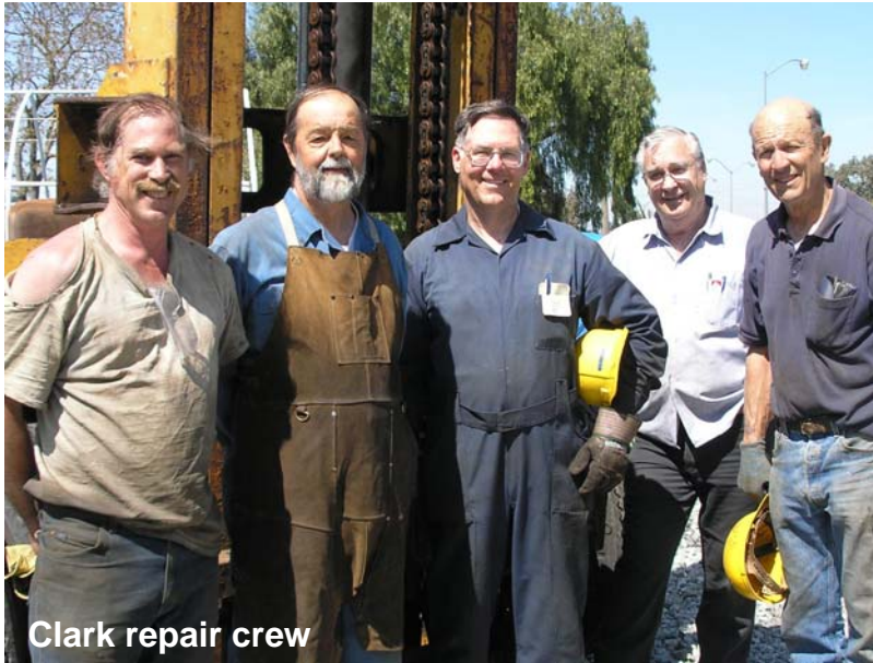
Clark repair crew

installed and 2/3 of the boiler has been cleaned and repainted. They still need to install two rigid and one flexible staybolt to complete the task and need to repair the water column fittings. Regarding the site and equipment maintenance, the Clark forklift