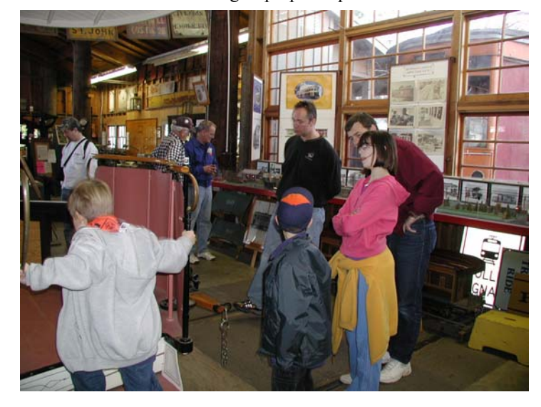
Transportation Experience class. 100% Motormen/Host coverage for weekends and special events

22 School groups participated in the Historic