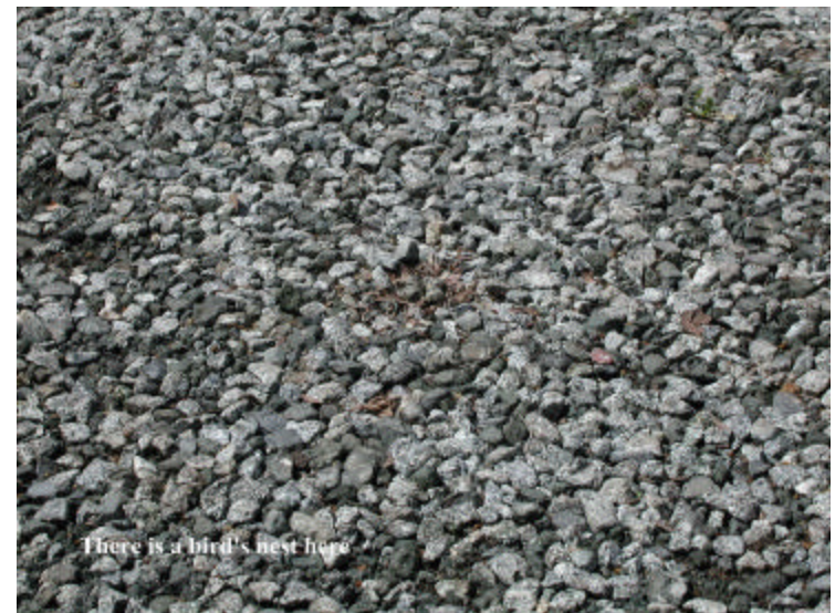
Can you see it now? Look for something organic.