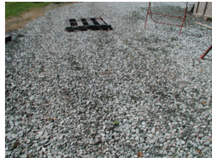
There is a bird's nest in this picture (Picture taken at the Fair Grounds site.)