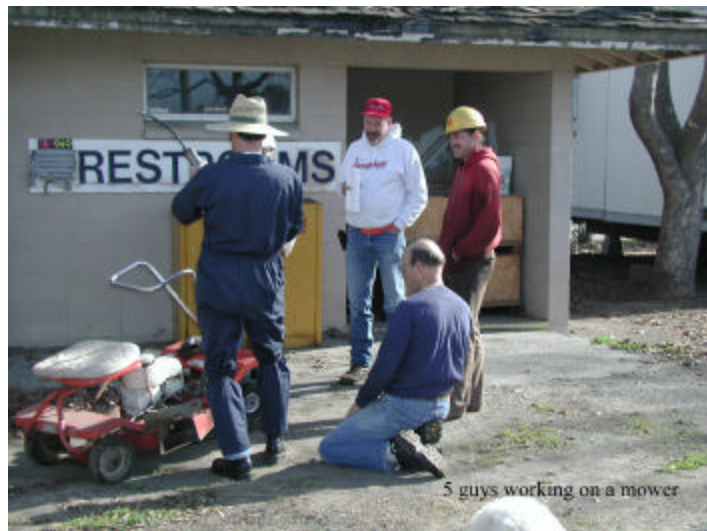
Five guys fixing a riding mower.