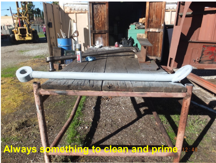
Always something to clean and prime 12:46

Dimensions of the piston ring grooves are being verified with a test block. Test blocks mimic the dimensions of the new rings. In the coming weeks, material will be ordered so that the process of machining new piston and valve rings can begin.