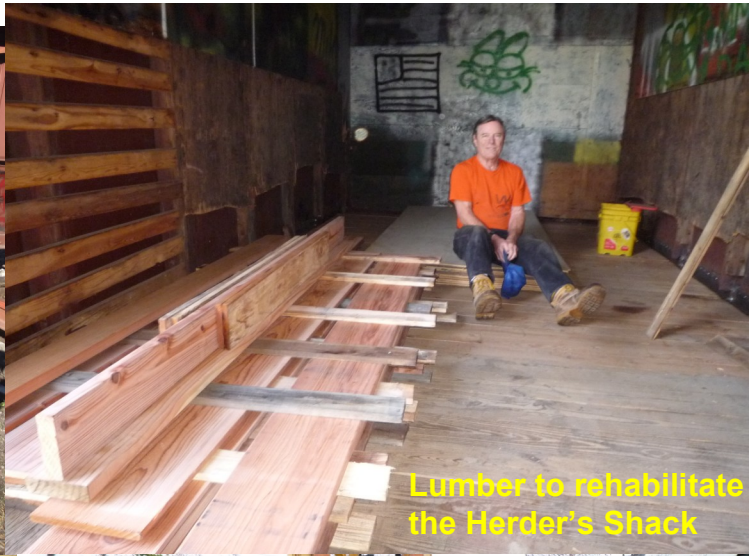
Lumber to rehabilitate the Herder's Shack