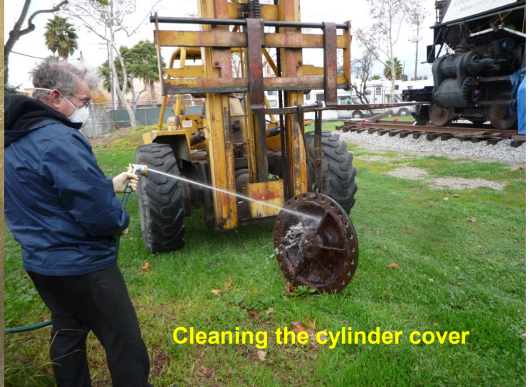
Cleaning the cylinder cover