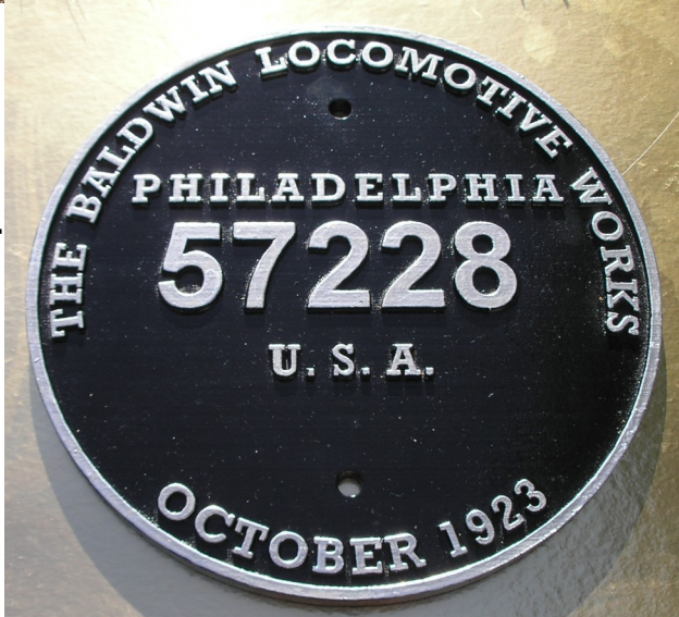
Our builder's plate