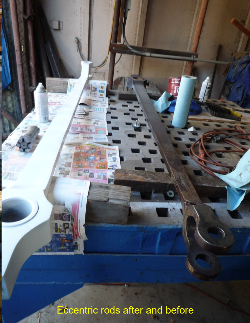
Eccentric rods after and before