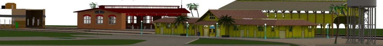
View from Coleman Avenue of the proposed railroad museum.