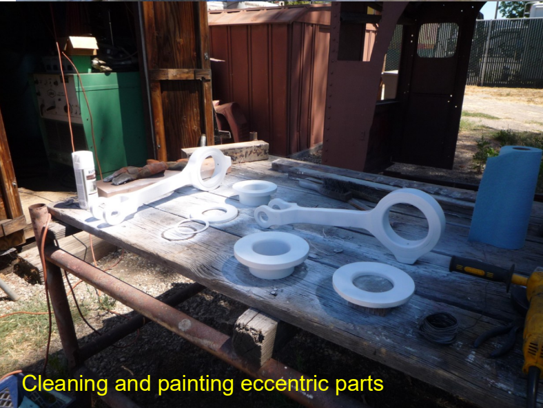
Cleaning and painting eccentric parts