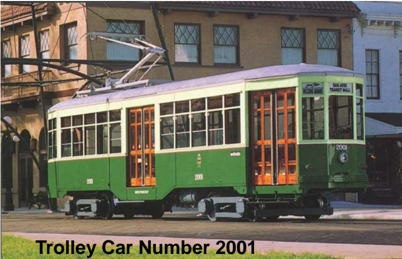
Trolley Car Number 2001