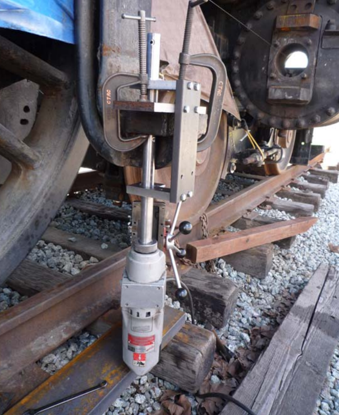
An intricate setup for boring crosshead guide mounting holes.

guides for the engineer side are also undergoing the renewal process. As of the writing of this article the Rockford plainer is being serviced and ready to machine the engineer side cross head guides. Additional work is continuing to keep the outer shell of the boiler coated with protecting paint. The area around the fire box has been wired brushed and painted to protect it from the weather.