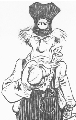
CTRCC WANTS YOU