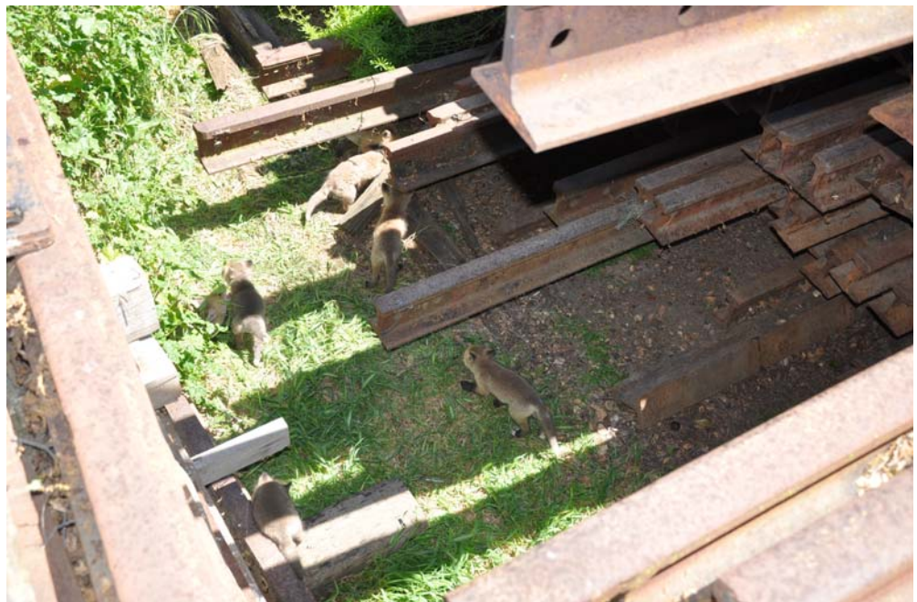
In this picture there are seven little foxes. Can you find them?

At the 2479 locomotive site mommy fox had a kit of seven babies. They found a home under and around the stack of rails.