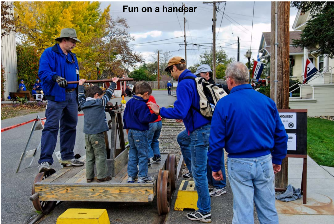
Fun on a handcar