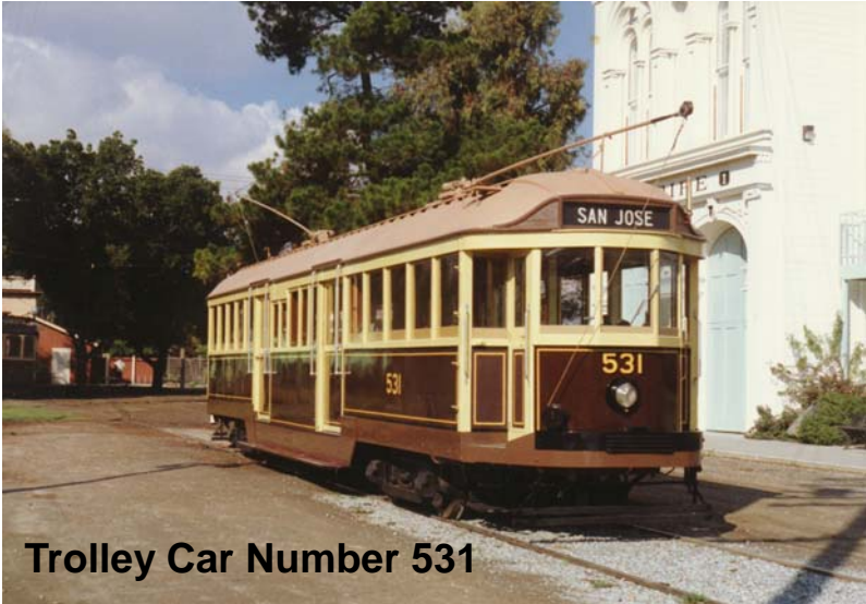
Trolley Car Number 531