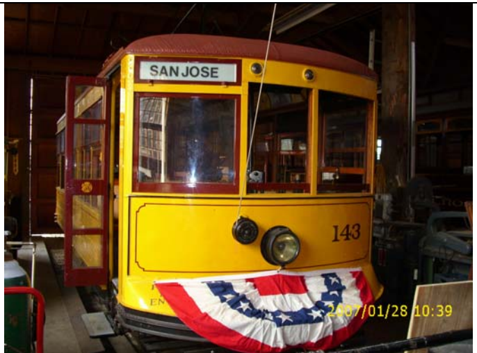
Bunting covers gap temporarily