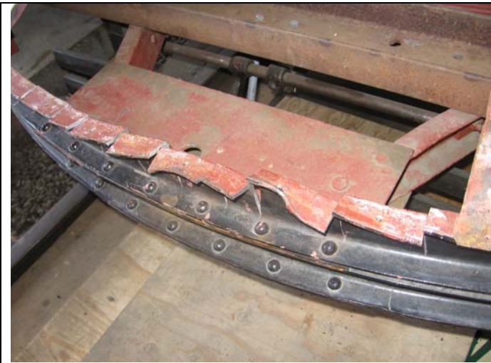
Segments Cut before Reshaping