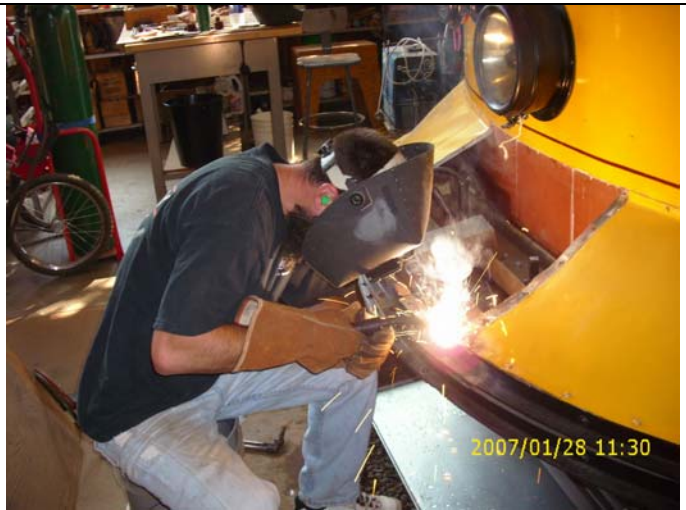
Welding some segments together