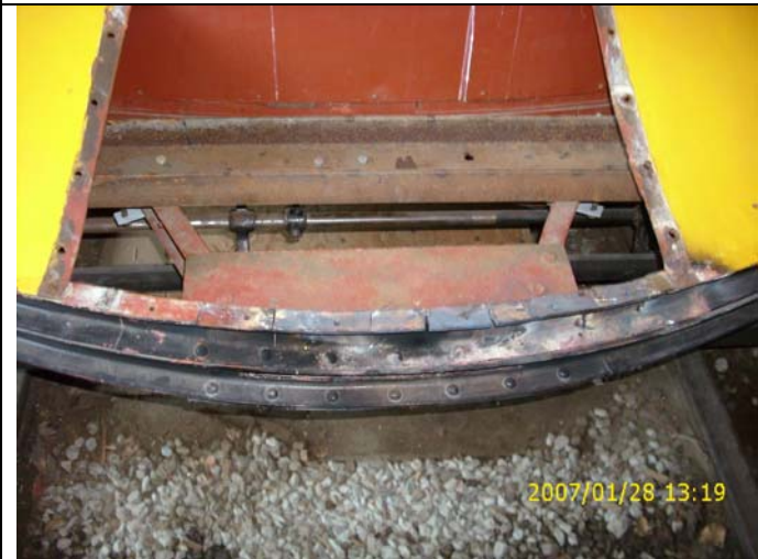
Bumper formed and awaiting final welding