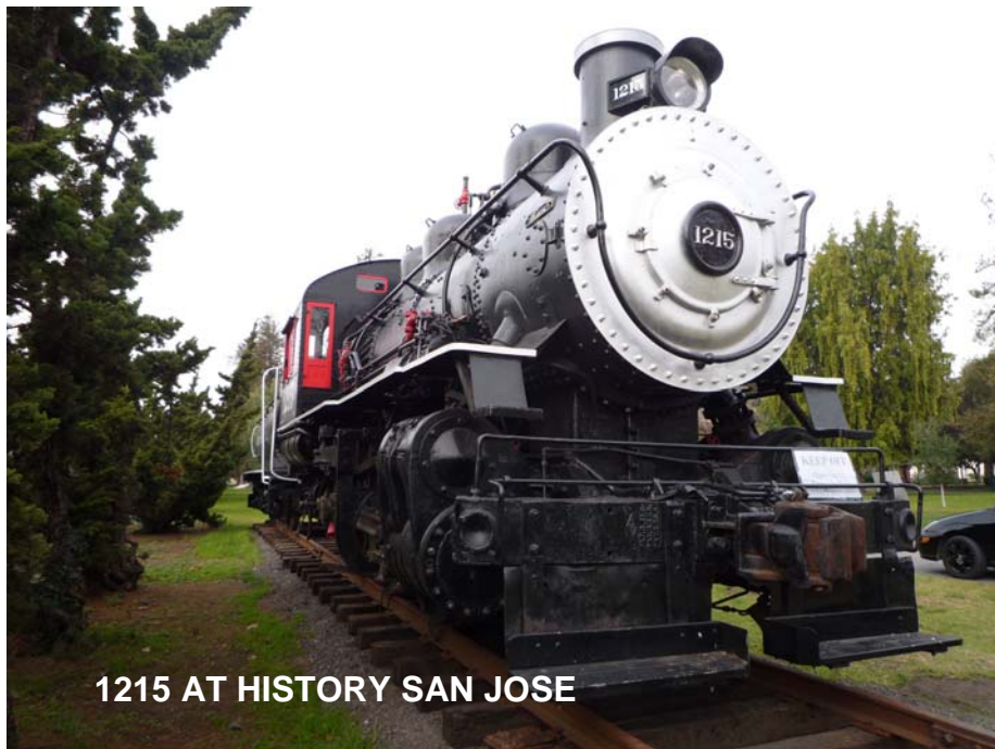
1215 AT HISTORY SAN JOSE

CTRC Focus: This President's Message suggests areas for CTCRC to refocus efforts during the coming year. Though each of our project areas is preceding well and the organization has substantial fiscal reserves, unlike most non-profits currently, we do need to break free a couple of project areas that have been on-hold for some time. The heart of CTCRC, and any non-profit organization, is the volunteers and fundraising which might well be the lead areas of effort for the coming year. These suggestions are the beginning of a collaborative goal setting process that will start at the February 17 CTCRC Board meeting.