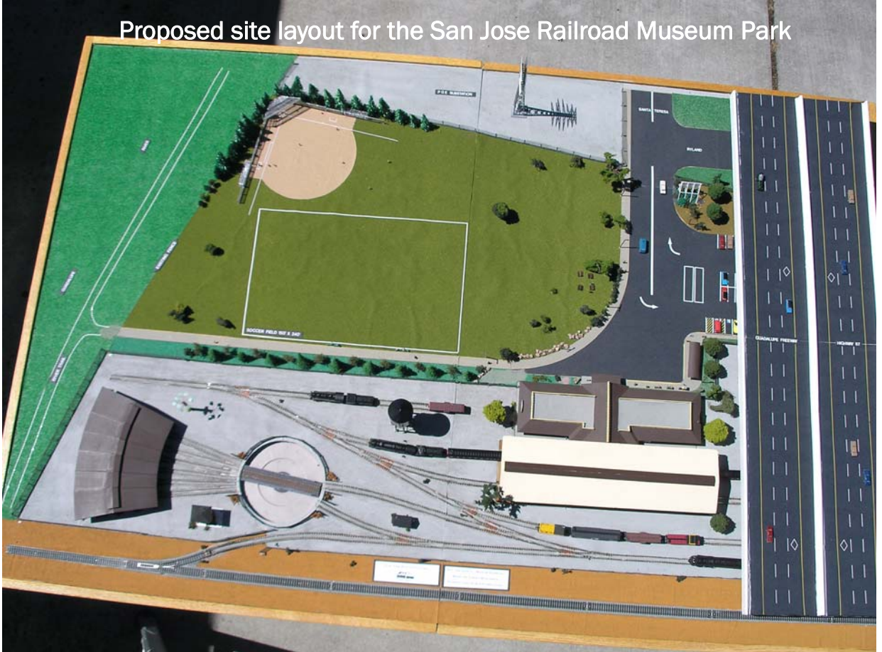
Proposed site layout for the San Jose Railroad Museum Park