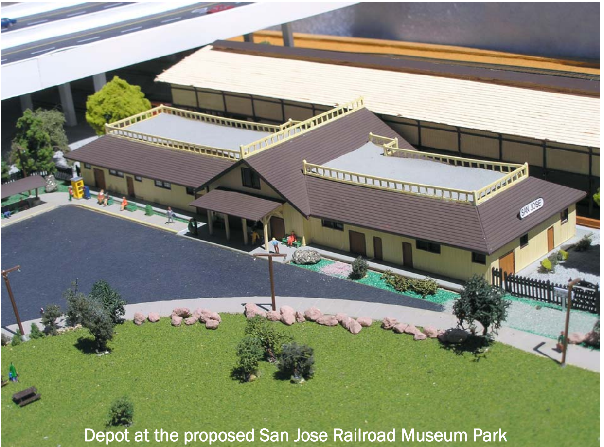
Depot at the proposed San Jose Railroad Museum Park

Created an N-scale model of our proposed San Jose Railroad Museum Park