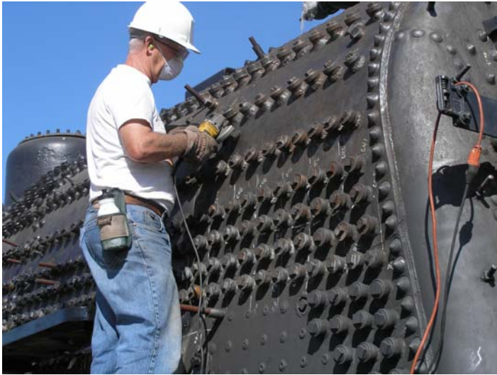
Install and hammer seal all remaining firebox stays.

Welded all remaining staybolt holes—approx 14. Attached by welding remaining staybolt half sleeves. Pad welded 6" X 4" Waste" area of firebox on left side along running board.