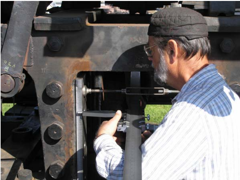
Ground flat #2 left and right shoe and wedge pedestal shoulders after weld repair.