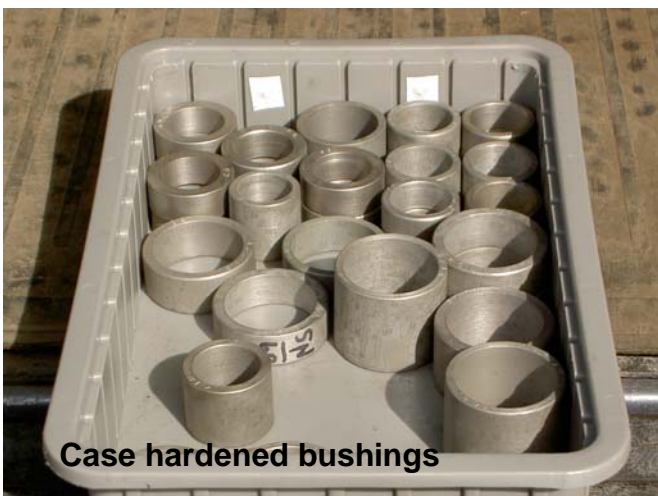
Case hardened bushings

Brake Rigging Restoration – I am happy to report that all the pins and bushings have been completed and all the brake rigging has been inspected and repaired. A substantial number of the brake rigging beams and links required extensive machining. Early this month all the 35 pins and 60 bushings were sent out to Boyntan of Santa Clara for case hardening. Rod D. arranged with the vendor to get the case hardening donated. This pro-