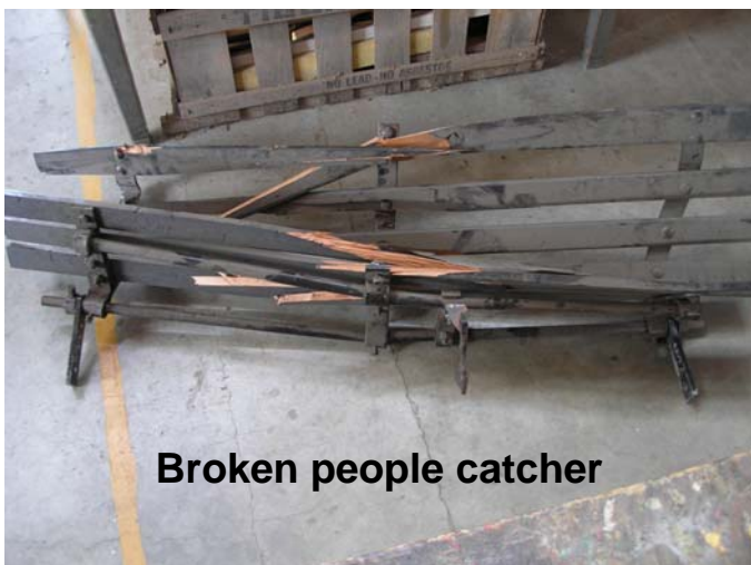
Broken people catcher

A motorman detected a minor electrical shock after the car spent 3 hours in the rain. The problem was found to be a combination of wet wood and several bolts that ran from the pole hook deck to the inside of the car. Isolating the hook from its deck eliminated the problem. We solicited and received input from 6 museums around the country through ARM (Association of Railway Museums).